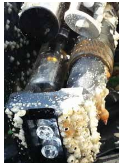
Clean sensor faces after nine months in-situ.