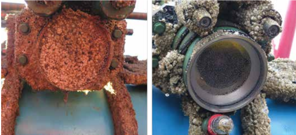
Cameras deployed for six months, without Cabled UV (left), and with Cabled UV (right). Note the incidental protection of the lights above the lens on the camera to the right.

Are TBT antifouling methods outlawed in your country due to its toxic impact on the environment?